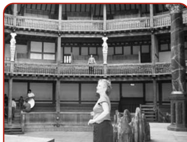
A view from the stage with Jo Howarth