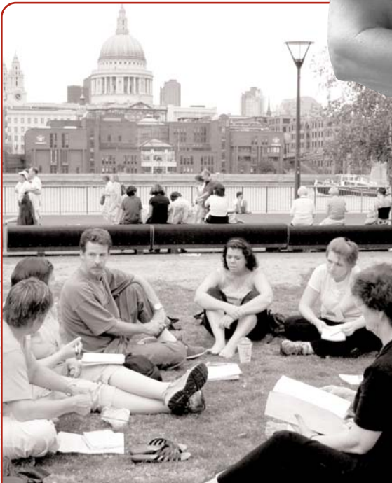
2005 participants in a group discussion by the Thames in London