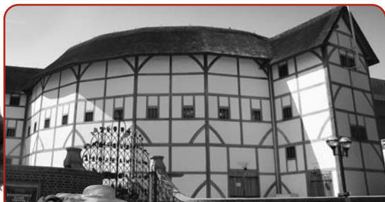
Shakespeare's Globe Theatre